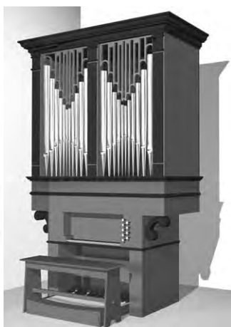
Rendering of seven stop tracker organ for Wesley United Methodist Church - Elkton, MD

It is a rare company that can encompass the best of it all, yet this is our goal.