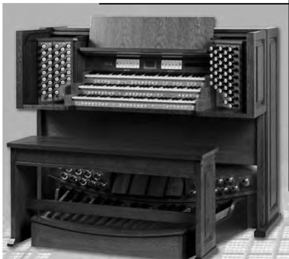
Rembrandt 397 Epiphany Lutheran Church Baltimore, Maryland

European quality and design now in America